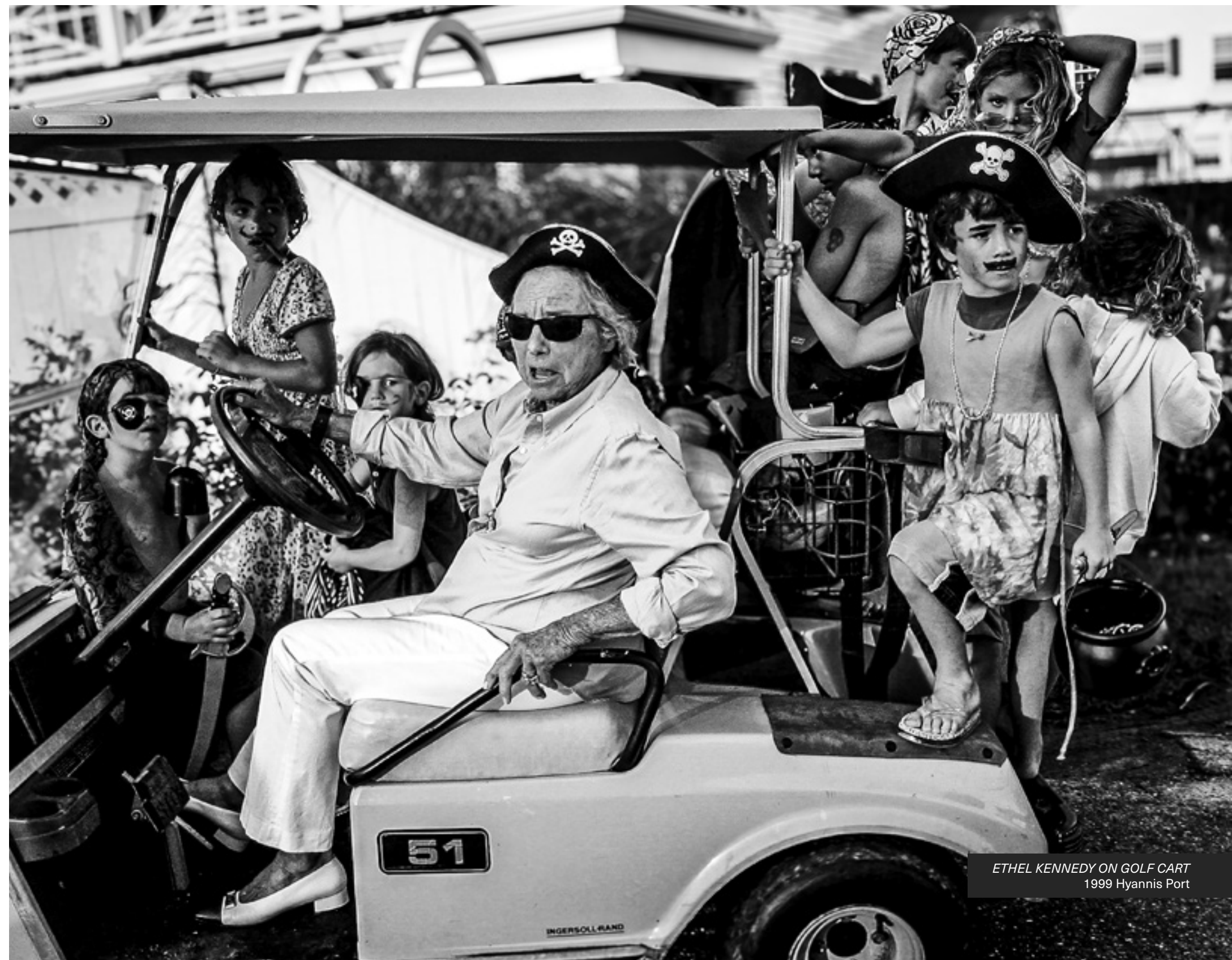
ETHEL KENNEDY ON GOLF CART 1999 Hyannis Port

John F. Kennedy Hyannis Museum, 397 Main St., Hyannis; jfkhyannismuseum.org