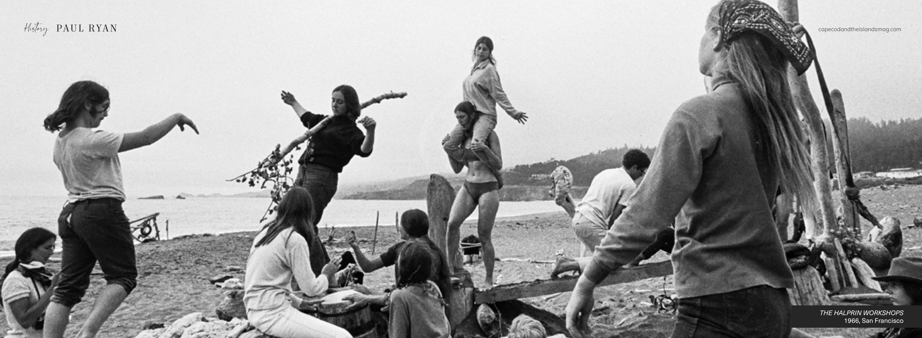
THE HALPRIN WORKSHOPS 1966, San Francisco