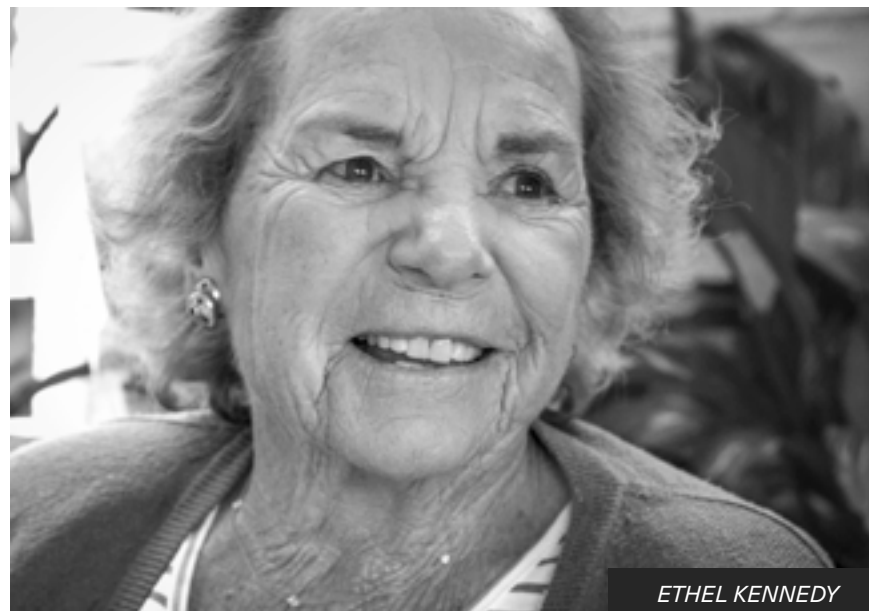
ETHEL KENNEDY 2013 Beverly Hills