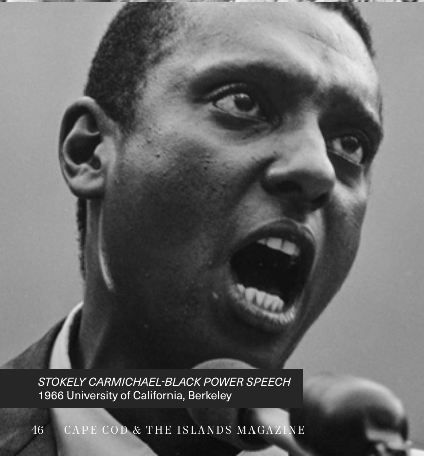
STOKELY CARMICHAEL-BLACK POWER SPEECH 1966 University of California, Berkeley