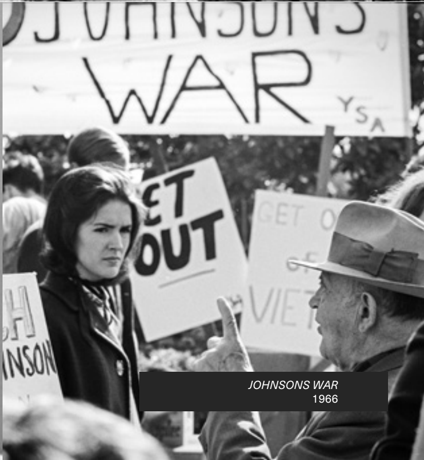
JOHNSONS WAR 1966