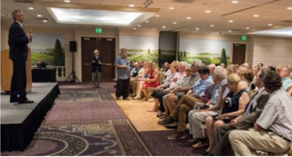
Robert F. Kennedy Jr. discusses his book "American Values"